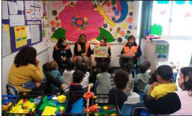
Figure 3– Awareness Session “Educate for Prevention”- School: Kindergarten Miguel Torga

Also, this project, started in 2014, has 13 different institutions enrolled (connected with seniors and elderly supports), with 33 senior agents collaborating with Amadora's Local Civil Protection Office.