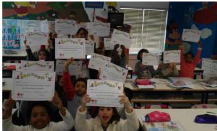
Figure 2 – Awareness Session “Child First Aid”

This program counts with the support of the Education and Sociocultural Department (DEDS-CMA) and it offers a set of awareness sessions that may be taught by several entities disponibiliza um conjunto de ações de sensibilização que podem ser ministradas por diversas entidades tais como: Serviço Municipal de Proteção Civil, Serviço de Prevenção Higiene e Segurança no Trabalho, Divisão de Serviços Urbanos – Eco-Espaço, Bombeiros Voluntários da Amadora), Polícia de Segurança Pública – Divisão da Amador, Cruz Vermelha Portuguesa – Delegação Local da Amadora, Unidade de Saúde Pública - Agrupamento de Centros de Saúde – Amadora, Equipa Comunitária de Resposta à Emergência e Elos Vitais.