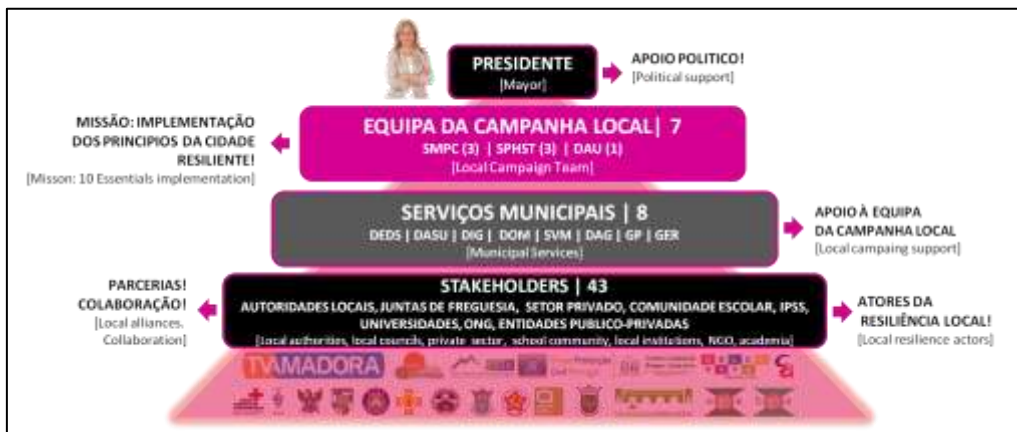
Figure 1 – Local Campaign 2010-2015 “Always in motion, Amadora is Resilient”