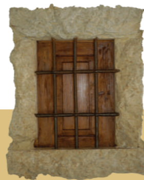
Window detail.