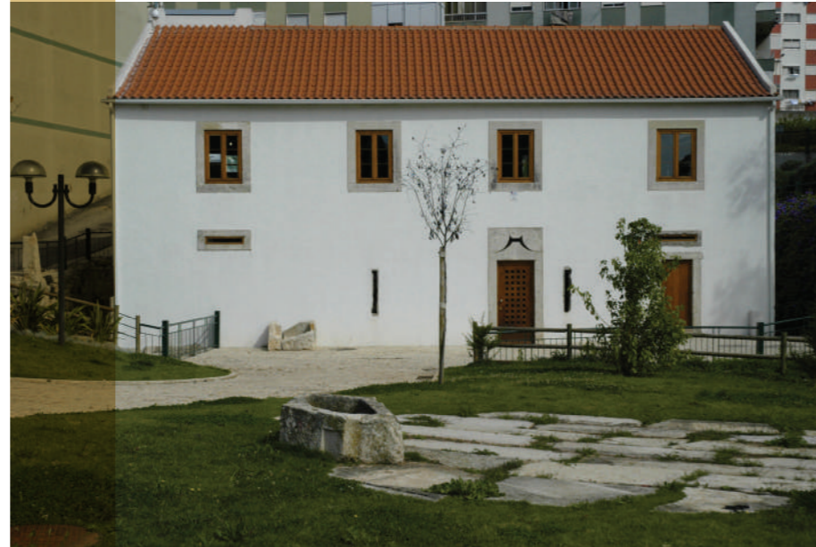
Casal da Falagueira de Cima nucleus Museum.

The entire rural house belonged, at an indeterminate time, to the Order of Malta or the Knights Hospitaller, as evidenced by the existing landmarks, one of them identified during the archaeological excavation in 1993, where the eight-pointed crosses, symbol of the religious order, are preserved.