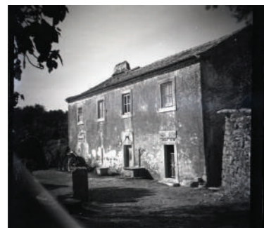
Casal da Falagueira de Cima (1960s).

The entire rural house belonged, at an indeterminate time, to the Order of Malta or the Knights Hospitaller, as evidenced by the existing landmarks, one of them identified during the archaeological excavation in 1993, where the eight-pointed crosses, symbol of the religious order, are preserved.