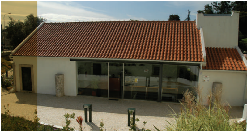
Casal da Falagueira Nucleus Museum.

Currently, Casal da Falagueira is the headquarters of the Amadora Museum, having several exhibition centers on Local Heritage. Various events are held, such as guided visits to the Historical and Archaeological Heritage of the Municipality, workshops within the framework of the "Museum in Action" project and other activities within the scope of the "Open School of Heritage" project.