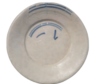
Faience (earthenware) dish.