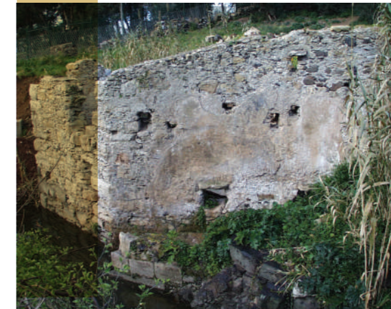
Casal da Falagueira de Cima Watermill.

Next to the house, a weir was built, which accumulated the water, and which allowed its conduction to the upper part of the vertical wheel of the mill through a canal, made of limestone slabs: the levada. Inside it was found a faience (earthenware) dish decorated with the cross-sword of the Order of Santiago produced in the 17th century.