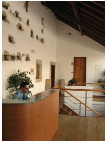
Dovecote holes.